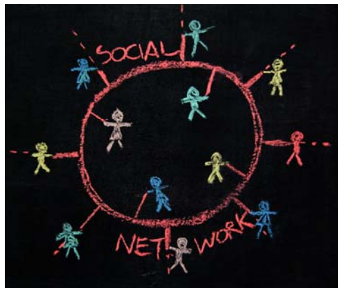
Simple outline of a social network.

Using these social media sites, the Madrid-based research initiative is seeking to establish an online presence through which to foster relationships with graduate, researcher and scientist communities wherever they may be, providing them with channels for interacting with colleagues, collaborators and the Institute IMDEA Networks itself.